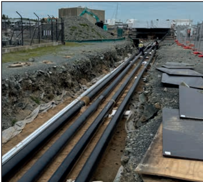
Above: Alternate view of the pipelines, post-application.