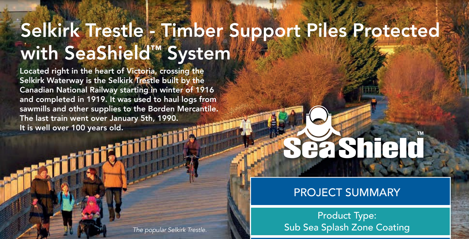
The popular Selkirk Trestle.

Located right in the heart of Victoria, crossing the Selkirk Waterway is the Selkirk Trestle built by the Canadian National Railway starting in winter of 1916 and completed in 1919. It was used to haul logs from sawmills and other supplies to the Borden Mercantile. The last train went over January 5th, 1990. It is well over 100 years old.