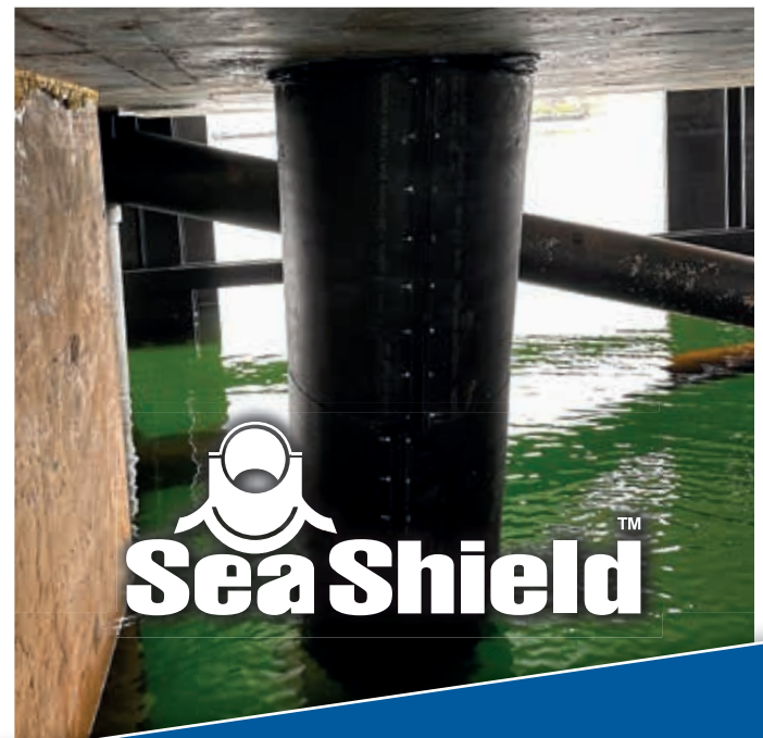
The complete Seashield 2000FD System protecting one of the piles.

Country: Isle of Lewis, Scotland Object: Steel Jetty piles Problem: Corrosion prevention Product Solution: SeaShield 2000FD™ System