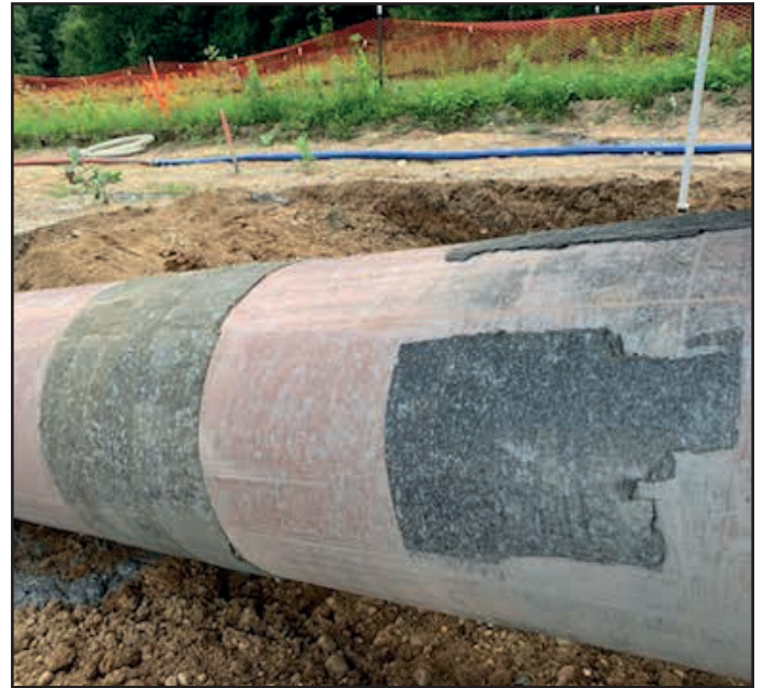
Above: The Denso Bore-Wrap™ is fully intact on the left after the pull.

Opposite: The Denso Bore-Wrap at the leading edge is still in place 360° around the pipe.