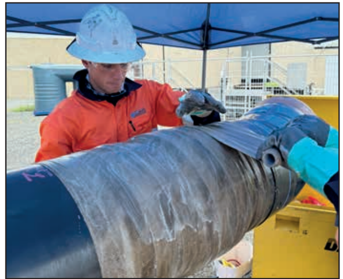
Above: Application of Denso™ Glass Outerwrap.