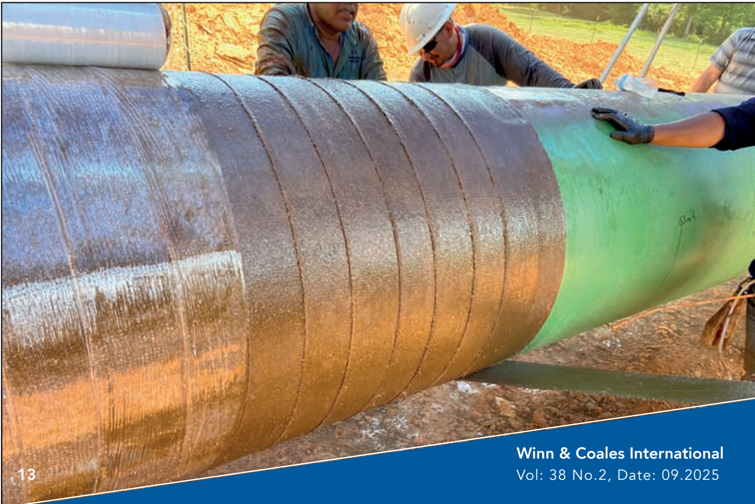
Below: Application of the Denso Bore-Wrap System

It is because of results like this, that the application of Denso Bore-Wrap has become standard practice for many pipeline operators around the world in HDD installations. They know their anti-corrosion coating will be completely protected from any mechanical damage, therefore preventing corrosion for years to come.