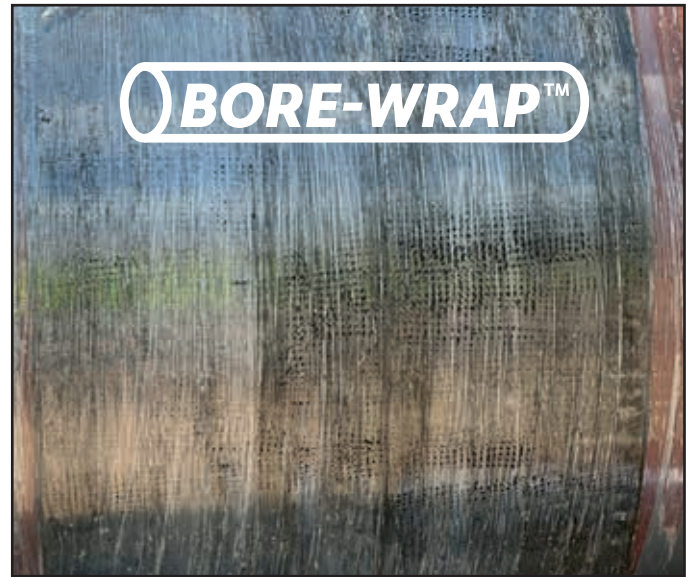
Above: The perforations allowing excess gas, resin, and water to escape during the curing process

On the first section, the Denso Bore-Wrap™ was installed at the lead end of the pipe followed by an outerwrap from a different manufacturer. On the second section the Denso Bore-Wrap was applied as the second wrap on the pipe. Upon completion of the pull both outerwraps were inspected. The Denso Bore-Wrap proved to be the superior product in both locations. When placed first at the leading edge, the Bore-Wrap held up 360 degrees around the pipe after an initial gouge that did not make it past the very first circumferential double layer whereas the product supplied by the different manufacturer was gouged completely through at various areas throughout the full 360 degrees. This proves how the Bore-Wrap fabric sets itself apart from other types of abrasion resistant outerwraps. The multidirectional weave provides exceptional resistance in all directions preventing rocks from finding a seam and tearing completely through the path of least resistance. When placed second, the Bore-Wrap was still completely intact 360 degrees around the pipe. In both locations the Bore-Wrap completely protected the underlying anti-corrosion coating.