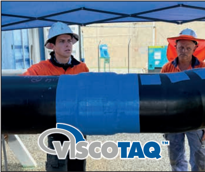
Above: Application of the Viscotaq™ System.