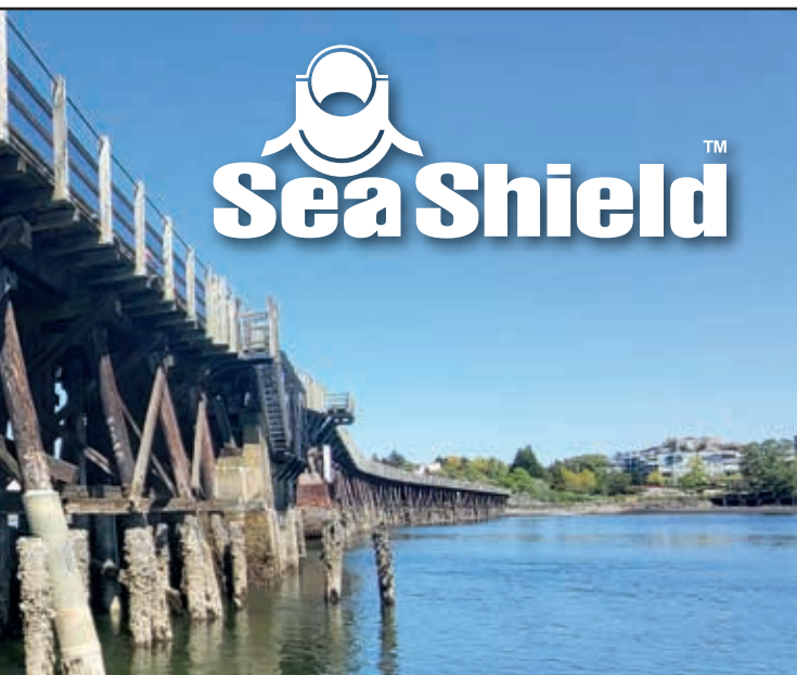
The completed SeaShield Series 400 System installed on the repaired piles.

Once the plugs cured, the rest of the jackets were grouted at low tide to ensure a complete cavity fill of grout. In cases where an extra jacket was needed for height, we used bell and spigots to connect the 2 jackets with SeaShield FX70 grout, stainless screws and then proceed to grout with SeaShield 510 to the top of the jackets. After curing, SeaShield 526 epoxy was used to create bevel caps to finish off the jackets.