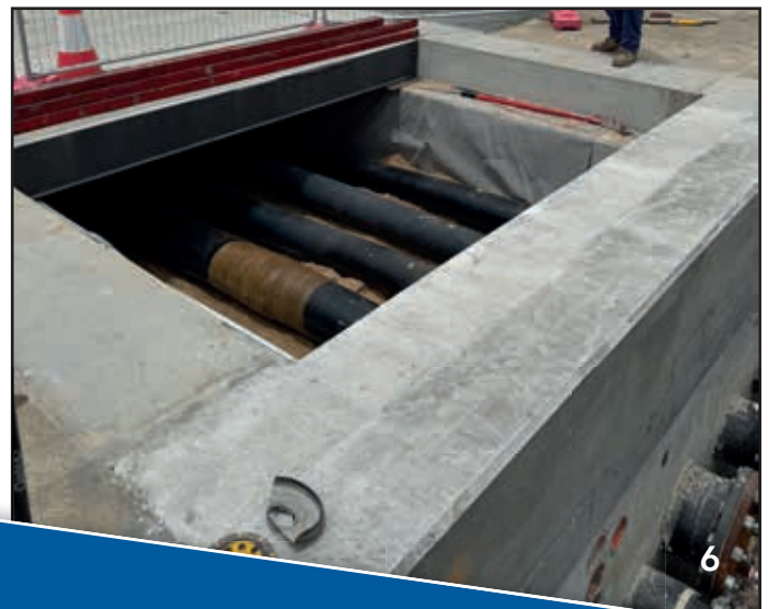
Below: View of buried pipelines post-application.

The diesel pipeline, coated with a 2-layer Fusion Bonded Epoxy (FBE) system, required a field joint solution that would bond effectively to the parent coating while providing superior corrosion resistance at the welds. The VISCOTAQ™ system was chosen due to its surface tolerance and adhesion, whilst the additional mechanical layers provided long-term stability and protection.