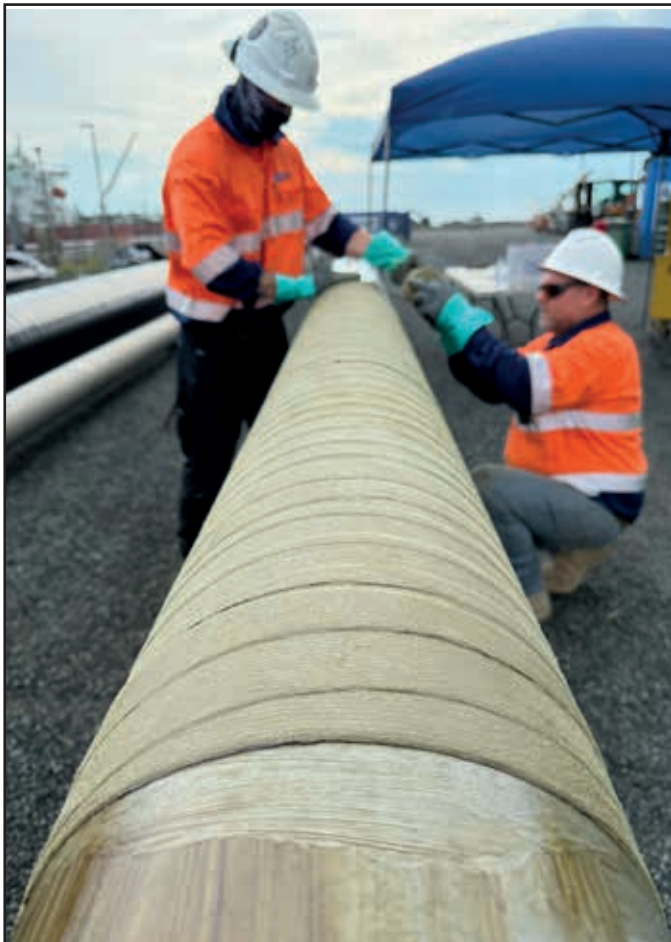
Application of the Denso™ Petrolatum Tape System to the jet fuel pipeline.

As an industry leader in corrosion prevention, Denso Australia provided several made-to-measure systems that will extend the lifespan of a Queensland tank farm’s pipelines and maintain their structural integrity.