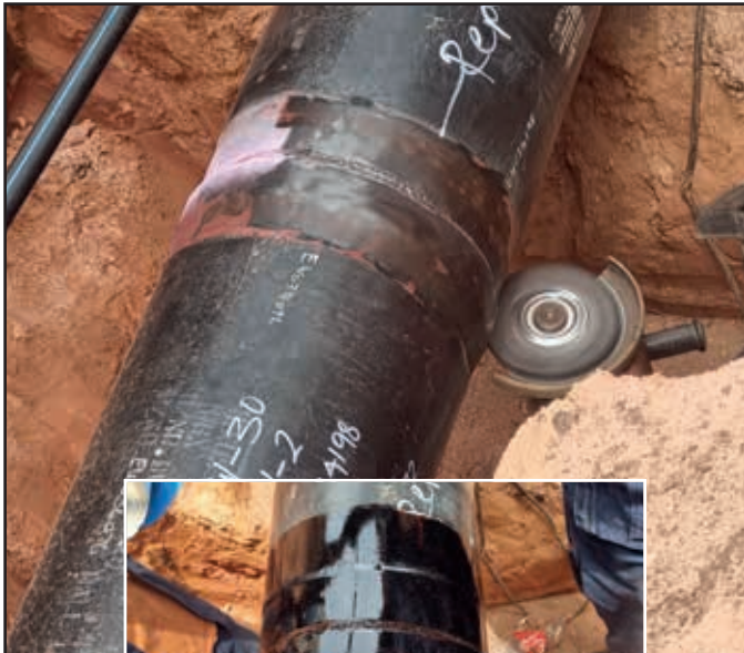
Preparation of the welded joint surface, using a hand-held power tool.

The surface was prepared using a hand-held power tool. Thereafter Denso Primer D™ was applied to the surface of the field joints. This primer was chosen for its excellent adhesion properties, ensuring a strong bond between the joint and the protective materials.