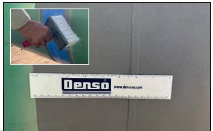
The girth weld is cleaned before application of the Viscowrap HT Tape. Inset: Regular brushing of the prepared substrate to remove airborne dust and sand during the application, is unavoidable in a desert environment.

Country: Kingdom of Saudi Arabia Object: Girth welds on gas pipeline Problem: Corrosion Prevention Product Solution: Viscotaq™ HT System