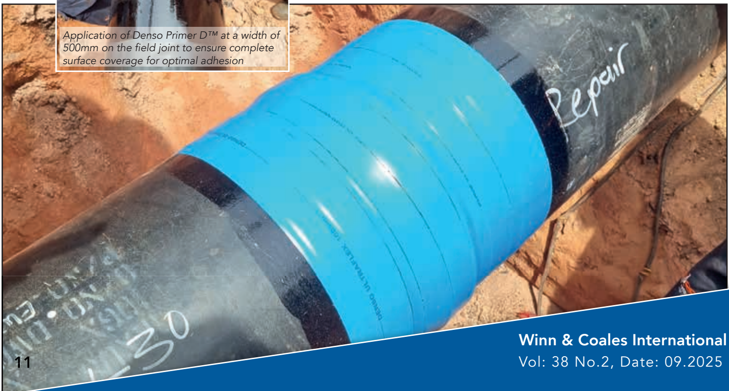
Below: The completed Denso welded joint protection.

Country: The Republic of South Africa Object: Welded field joints Problem: Corrosion prevention Product Solution: Denso™ Ultraflex System