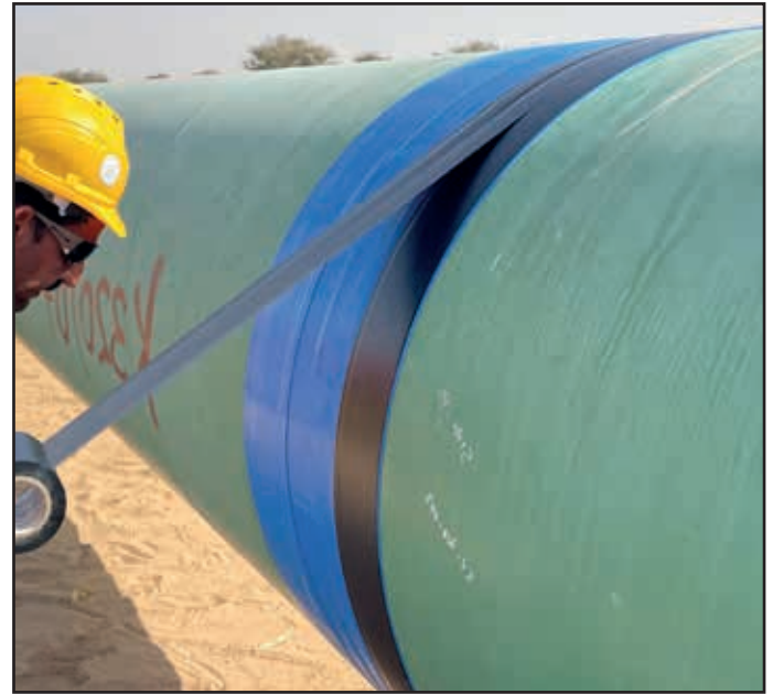
Application of the Viscotaq PVC Outerwrap.

For long term protection Denso's Viscotaq™ HT System has been specified to protect 10" and 56" diameter girth welds on the gas pipeline. The system comprises an inner layer of ViscoWrap™ HT Tape with an outer layer Viscotaq™ PVC Outerwrap.