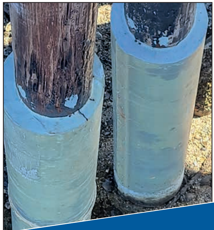
Top view of the completed grout filled jacket before installation of the SeaShield 526 Epoxy Bevel cap.

The project has been completed and all parties involved were happy with the end results. This historic structure is now safer and can be used for many more decades.