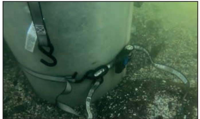
The SeaShield FRP Jacket at the mudline ready for plug to be installed.

The project has been completed and all parties involved were happy with the end results. This historic structure is now safer and can be used for many more decades.