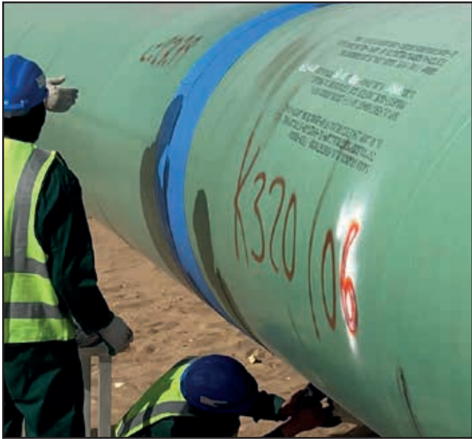
Application of the Viscotaq HT Tape.