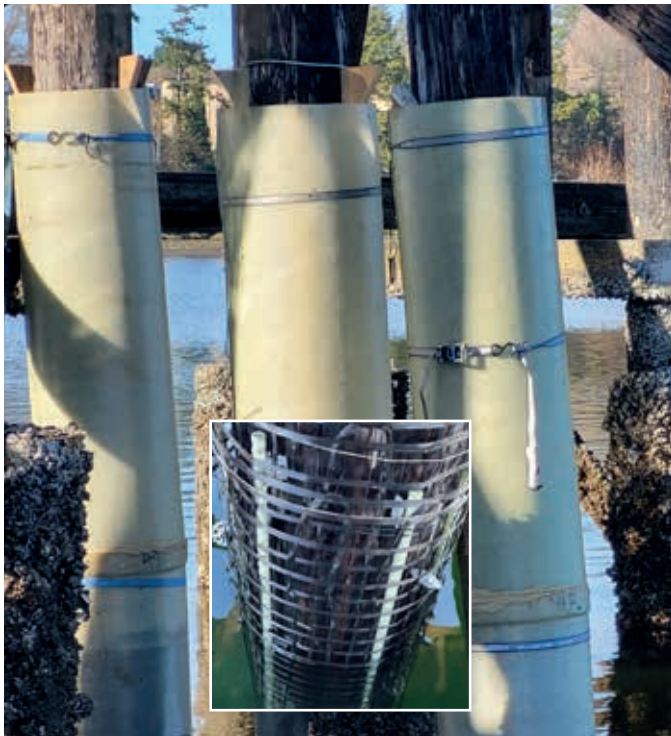
The SeaShield Jackets in place ready for the cavity fill of SeaShield 510 grout.

Salish started the cleaning of the piles marked for repair and then working with divers in the water, started the process of spacing the C-Grid properly with the Fiberglass reinforcing rods. Then the correct spacing between the C-Grid, rods and Series 400 Jackets was worked out. Stiff tubes of pvc were adapted with camlocks and used to get the grout evenly distributed via tremme method right on the seabed to pour a plug.