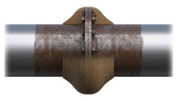
Section of pipe with Denso Profiling Mastic applied