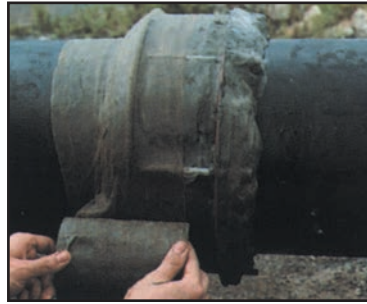
Overwrapping with Denso Tape