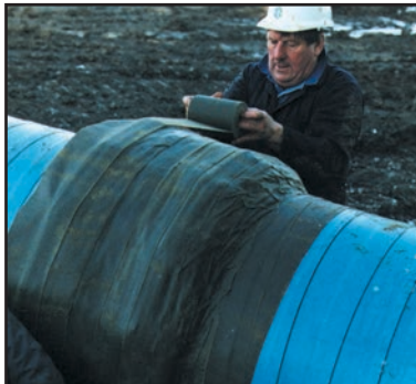
being overwrapped with Denso Tape...