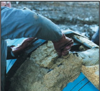
P1* application: Profiling Mastic on Tybar...