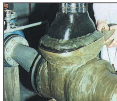
Overwrapping with Denso Tape