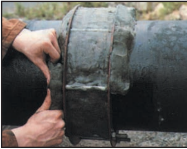
Profiling and infilling with Densyl Mastic