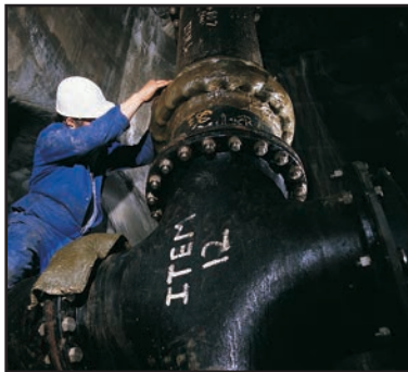
being overwrapped with Denso Tape...