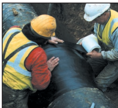
being overwrapped with Densoclad Tape...