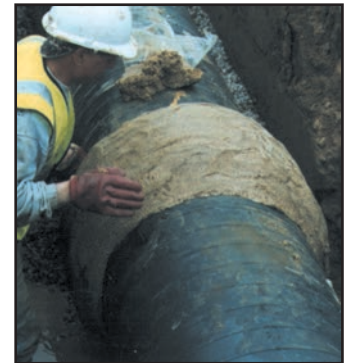
Denso Profiling Mastic