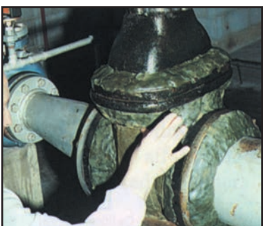
Profiling with Densyl Mastic