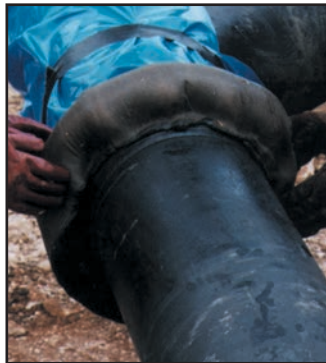
Densyl Mastic Blankets

Self-supporting and non-cracking, Denso Pipeline Mastics remain permanently plastic whilst being impervious to moisture. They are highly resistant to mineral acids, alkalis, salts and mechanical stress over a wide temperature range. These characteristics give the products great versatility. Used prior to the application of Denso or Densoclad Tape, the products are ideal for building up contours on mechanical pipe joints, valves, bolted flanged joints, etc. Should it be necessary at any time to examine, modify or repair the items so sealed, the Mastics can be easily removed and re-used if required provided the product has not been contaminated.