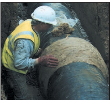
P2* application: Profiling Mastic on flange...