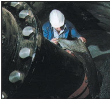
P1* application: Mastic Blanket on flange...

*Civil Engineering Specification for the Water Industry, Fourth Edition 1993